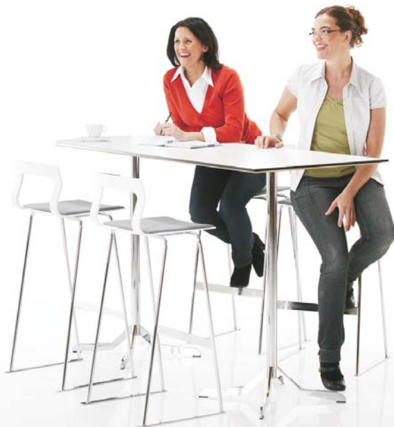
Mix bar table and bar stools. Tabletop with black edge can be ordered as special.